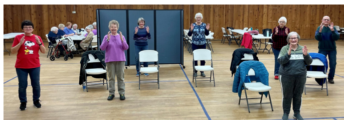
Participants enjoy a Tai Chi class led by MSU Extension staff.