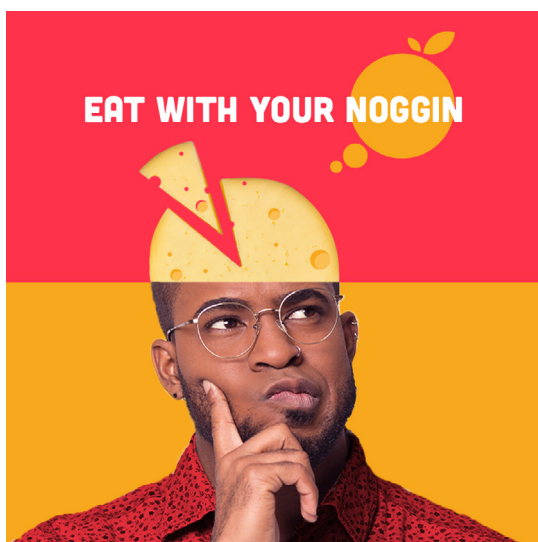
A promotional graphic from the Think Food Safety social media campaign.

Think Food Safety resources. Think Food Safety (TFS) began in 2020 as a food safety awareness campaign to educate the public on safely purchasing from food vendors and to encourage prospective entrepreneurs to safely launch their Cottage Food businesses. In 2022, the TFS team grew its social media channel and launched a podcast with five episodes, with topics from preserving garden bounties to licensing a food business.