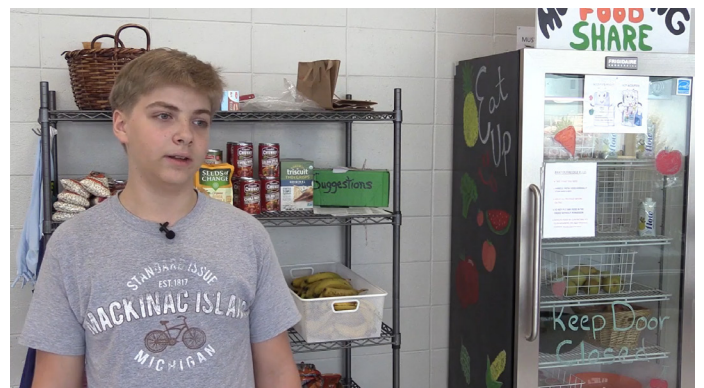
A student at Munising High School discusses the benefit of an MSU Extension project that created a free food pantry in the school.

Policy, systems and environmental changes (PSEs). PSE work focuses on changing environments such as schools, workplaces and community centers to make healthier choices easier for everyone. Switching out the sugary beverages in a school vending machine for healthier options is one example of a PSE change. In 2022, MSU Extension helped implement almost 37,000 PSE changes at 185 sites across Michigan, reaching 157,191 people.