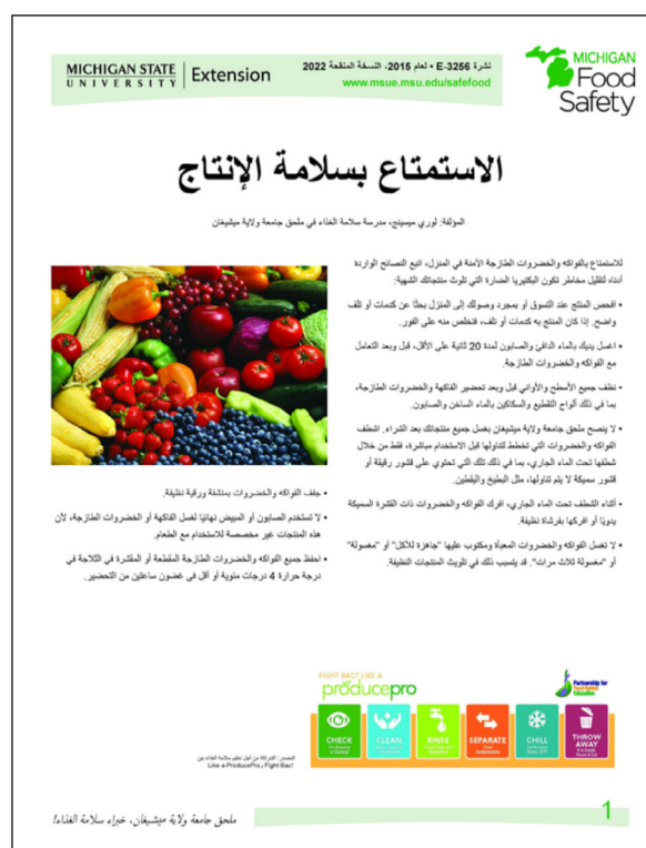
One of MSU Extension’s food safety factsheets, available in Arabic.