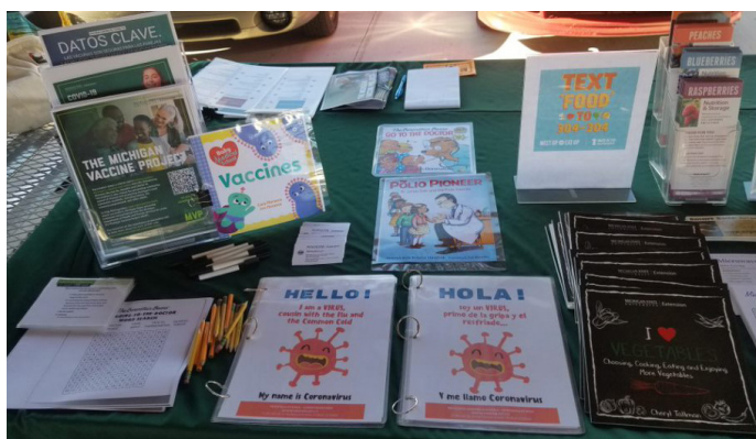
Michigan Vaccine Project materials available at the Kalamazoo Farmers Market.